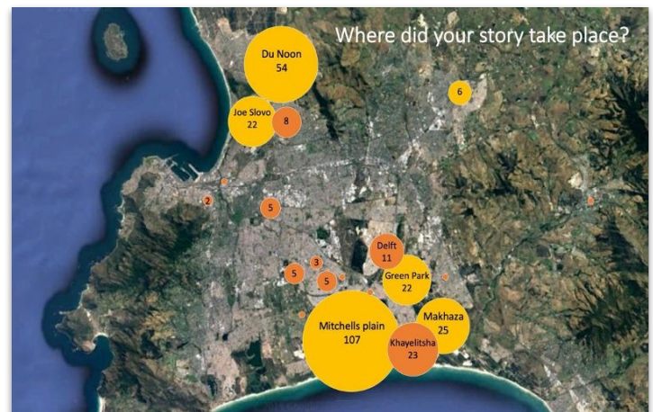
Above | Number of respondents interviewed in Cape Town neighbourhoods Below | Constructive dialogue between WCWC and CoCT emerged from a workshop that included role playing common problems, backed up by hard numbers and data

311 responses were collected from across Cape Town. A number of workshops and sessions were then used to return stories and present findings to the studied communities and CoCT officials. Activists and academics collaborated to help share the qualitative stories as well as quantitative evidence of themes that emerged across the sample. Tensions did occur between the two different types of knowledge and levels of interpretation of the data, so translating the insights into practice was not always easy. However, learning how to work with this tension is important for transdisciplinary work that aims to support collective adaptive capacity. The process strengthened relational competency between the CoCT and WCWC, and the WCWC have subsequently been brought into city-wide policy and planning activities.