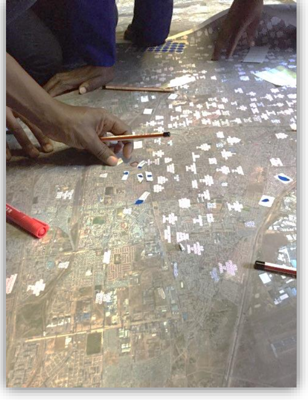
Participatory mapping can spur conversations about resilience among multiple actors.