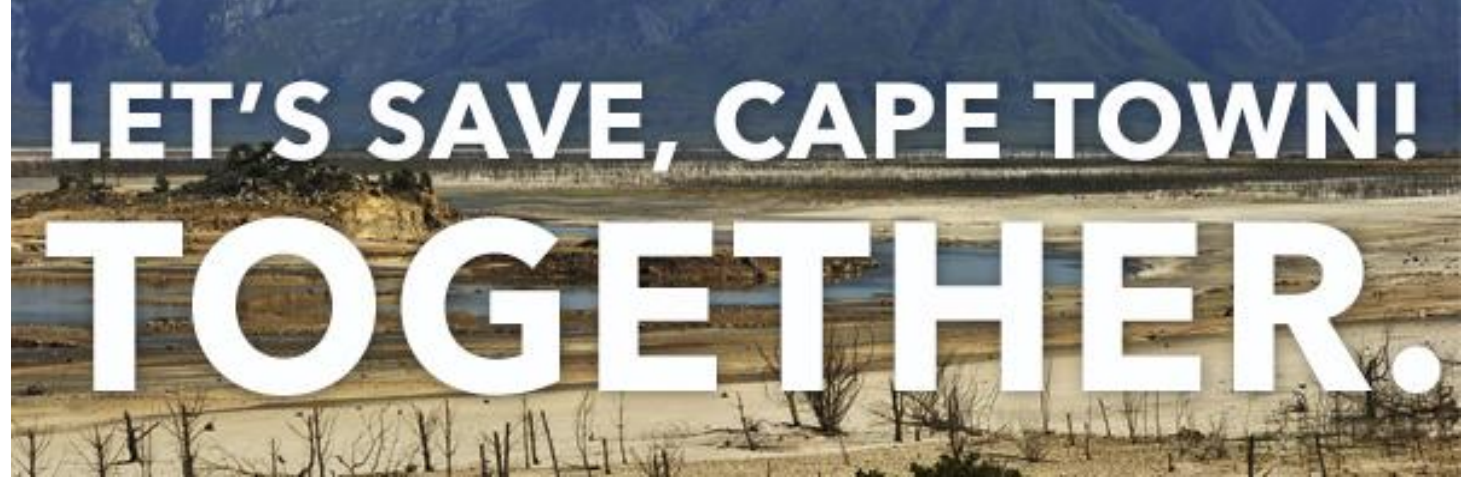
Above | Official poster, issued by the City of Cape Town.